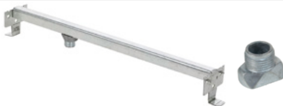
6010DW-25 / 6010ADW-25