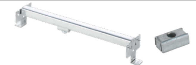
6011DW-25 / 6011ADW-25