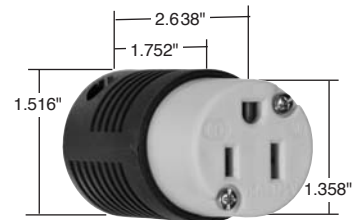
Dimensions for 15 & 20 Amp Connector