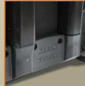
Molded kick plate to protect from the elements