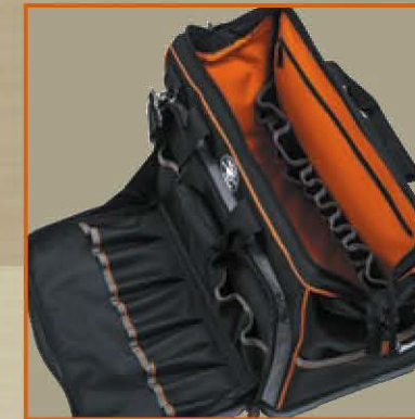
Maximum tool storage with shoulder strap and handles for easy carrying