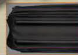
Protective guards and water resistant bottom

Tough, durable molded bottom protects from the elements