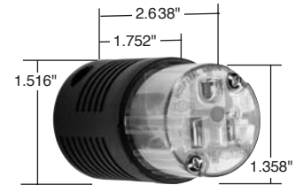
Dimensions for 15 & 20 Amp Connector