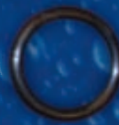
KO SEALING RING