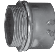
4125S - 4400S