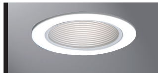
4010WB White Baffle, White Trim