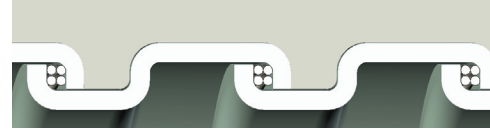
Square-Locked Design with cord packing 3/8" through 1-1/4"