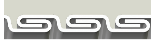
Interlocked Design 1-1/2" through 4"