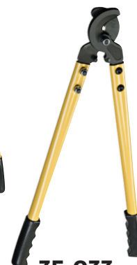
35-033 1000 MCM