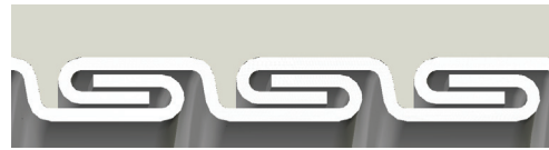
Interlocked Design 1-1/2" through 4" with no bonding wire