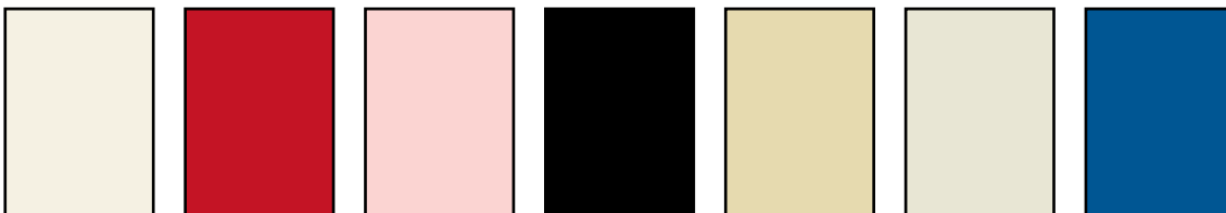
Primer Red Pink Flat Black Ivory Light Almond Blue

To order custom metal wall plates, see Pages P-40 – P-44.