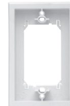
1594TPAW EXTENSION RING