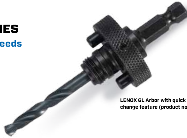
LENOX 6L Arbor with quick change feature (product no 1779805)

Split point pilot drill for faster penetration and less walking