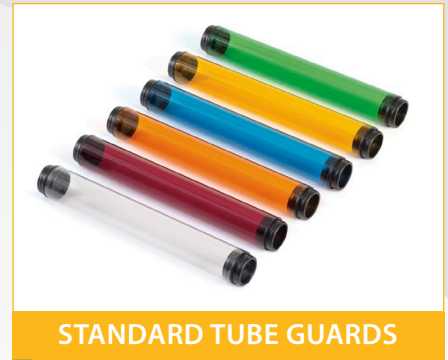
STANDARD TUBE GUARDS