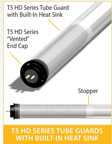
T5 HD SERIES TUBE GUARDS WITH BUILT-IN HEAT SINK

Simply insert the lamp into the T5 HD Series Tube Guard, insert the “vented” end cap on each end of the tube guard and install the “tubed” lamp into the luminaire.