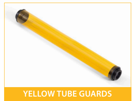
YELLOW TUBE GUARDS