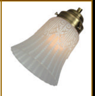
-155 GLASS- Bamboo Bell with White Hand-Etched Oval Finish.