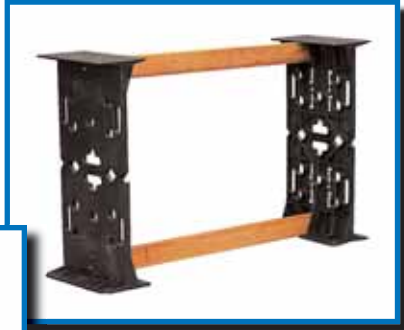
Work bench frame

ONE TOOL • Many uses • Many configurations