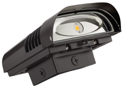
Top Visor and Vandal Guard