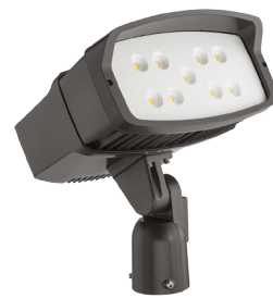
Vandal Guard (Polycarbonate lens) OFL2VG