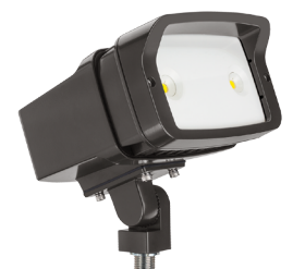
Vandal Guard (Polycarbonate lens) OFL1VG