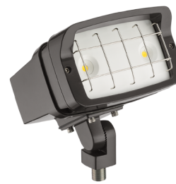
Wire Guard OFL1WG