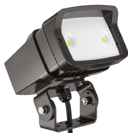
YK- Yoke mount